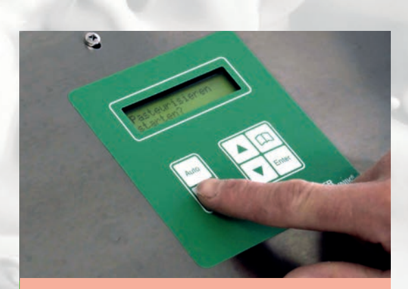
Completely automated pasteurisation

The milk is heated in the coiled tube heat exchanger and held exactly at the pasteurisation temperature so it cannot overheat. The natural milk taste is retained.