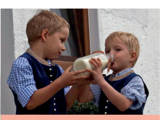
Natural milk taste

In the short pasteurisation process, the milk is heated to 72°C for 15 seconds and then cooled down again. The continuous flow pasteuriser can process between 10 and 1500 litres of milk per day.