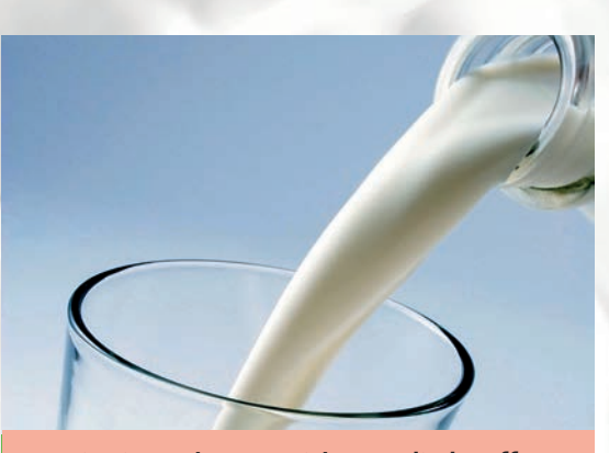
Hygienic and pure with very little effort

A process controller runs through the pasteurisation process completely automatically when the start button is pressed. From warming up, heating, keeping hot and cooling to rinsing with water.