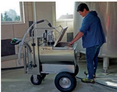
Horizontal tank with water bath

Förster-Technik's MilchMobil is a convenient, sturdy solution that makes supplying feed to calves in individual stalls or igloos easier, saving you lots of time and work. With MilchMobil, the feed mixing, heating, transporting and dosing processes go much smoother and faster. MilchMobil 4x4 by Förster-Technik is ideally suited for a variety of different farm sizes – available in 120 and 200-liter versions.