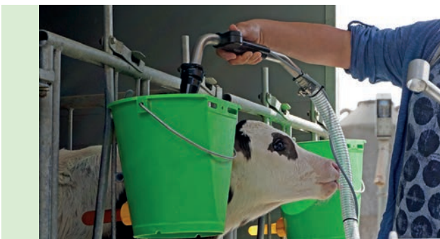
Simple and easy-to-use dosing unit