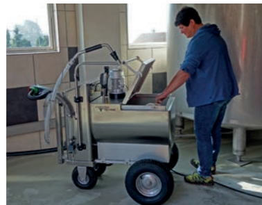
Horizontal tank with water bath

Förster-Technik's MilchMobil is a convenient, sturdy solution that makes supplying feed to calves in individual stalls or igloos easier, saving you lots of time and work. With MilchMobil, the feed mixing, heating, transporting and dosing processes go much smoother and faster. MilchMobil 4x4 by Förster-Technik is ideally suited for a variety of different farm sizes – available in 120 and 200-liter versions.