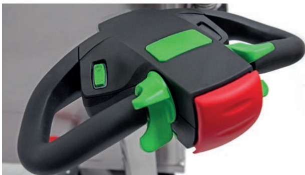
Drawbar head with integrated function keys

MilchMobil 4x4 comes standard-equipped with mixer, heater, tank cleaning function, user interface, portion control, two-speed drive system and LED lamp.