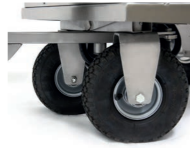
Pendulum axle and steering

An integrated, rotating tank cleaning nozzle conveniently cleans the tank in a few easy steps at the push of a button, so MilchMobil 4x4 is ready to go again in no time.