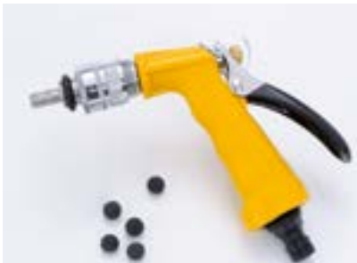
Hose cleaning pistol

The semi-automatic mixer cleaning system is efficient and easy to operate. At the press of a button you have water with a high temperature at your disposal. The open, tiltable feeding box is easily accessible and makes it possible to easily do a function check at any time. You can easily remove deposits in the suction hoses with the help of the hose cleaning pistol and also clean longer hoses with no trouble.