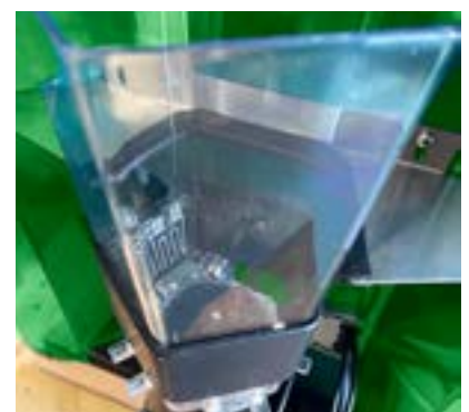
Mixer heating system available as an accessory

The boiler, which has a temperature sensor, an electronic heating regulator and a minimum temperature monitor, ensures that the feed always has the right temperature, and can be easily configured and checked.