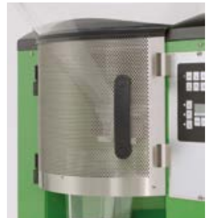
Optional fly protection screen

The fine-pored fly screen for the mixer prevents flies from getting into the feeding box. Steam that arises in the feeding box can easily escape because of the large size of the box and through the pores; condensation water is easily prevented this way.